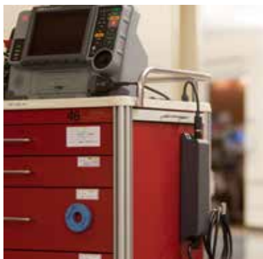
AC Power Adapter

The unit's self-checking feature alerts our service team if the device needs attention, so you know it's ready when you need it. Our on site maintenance and repair, access to original manufacturer parts, and highly trained, experienced service representatives give you the peace of mind that your LIFEPAK 15 will be ready when you need it.*