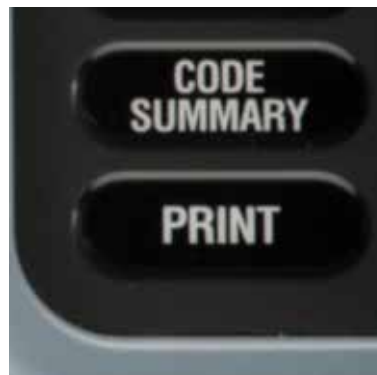
CODE SUMMARY™ critical event record